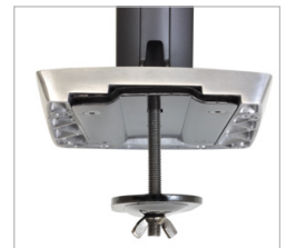
Grommet Accessory for WorkFit-A 97-692